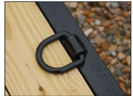
1 Pair D-Rings