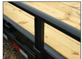
2 3/8" Pipetop Removable Siderails (CC, C8)